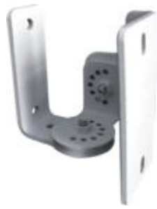
← Installation Bracket ( \pm 90^\circ adjustable)

Best for auditorium, square, bus/railway station, church, meeting room, halls, etc;